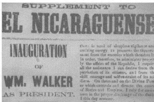
El Nicaraguense , Granada, July 12, 1856